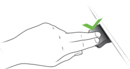
Figure 6: Press and hold the DPG1K to drive the desk down