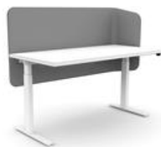
Altitude A8 L Screen Right Hand (32\"/>