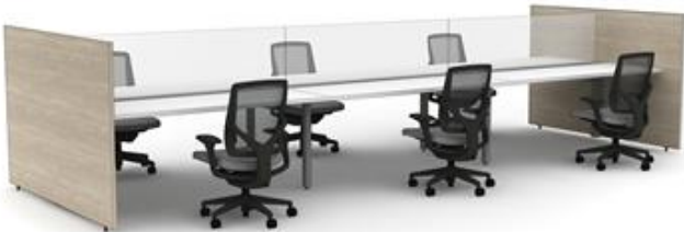
Galley Panel (50"H) End-of-Run T-Connection, L-Connection, Mid-Connection Available in 30"H, 35"H, 42.5"H, 50"H, 57.5"H 30"W-84"W Laminate and Laminate with Integrated Glass