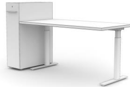
Approach Pull Out Tower (50"H) Also available in 42"H option **currently available through standard special (Involve) 24"D, 30"D 12"W