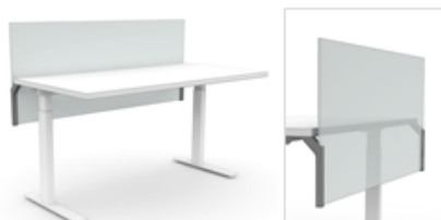
Involve End Privacy Panel (25\"/>