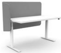
Altitude A8 L Screen Left Hand (32\"/>