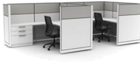
42.5”H panels w/ 15”H Stacking Frames Stacking frames available in 15”H, 22.5”H, 30”H 24”W – 60”W (15”H Stacking Frame – Fabric 15”H Stacking Frame – Glass)