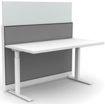
Stride Panels (42.5"H) (7.5"H) Frameless Glass Stacker Glass: 24W – 96"W $433 - $1,288