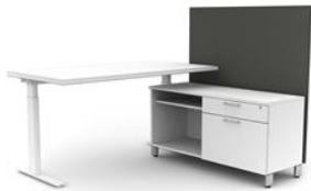
Involve Single-Sided Cantilever Storage Low with Credenza Rail Mounded Screen 50"H 29"W – 59"W