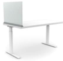
Stride Lateral Divider Screen (20\"/>