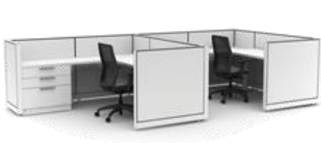
Base station: 42.5”H panels 24”W – 60”W 30”H, 35”h, 42”H, 50”H, 57”H, 65”H (Two Pack – seating and electrical NIC)