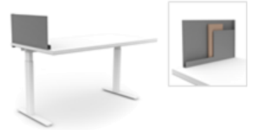
Further Lateral Screen (12\"/>