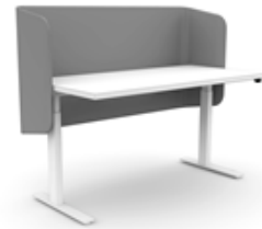
Altitude A8 U Screen (32\"/>