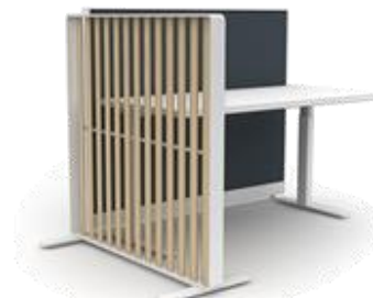
HBF Kinzie Screen (48"W x 48"H) Metal frame with wood slats 48"H, 60"H 36"W, 48"W