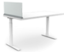
Stride Lateral Divider Screen (13\"/>