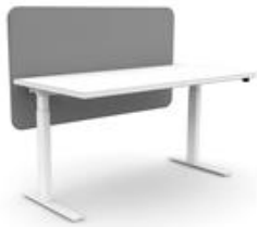
Altitude A8 Straight Screen (32\"/>