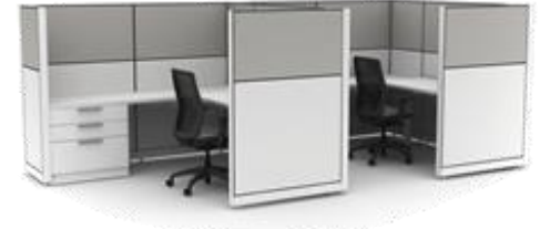
42.5”H panels w/ 22.5”H Stacking Frames Stacking frames available in 15”H, 22.5”H, 30”H 24”W – 60”W (22.5”H Stacking Frame – Fabric) (22.5”H Stacking Frame – Glass)