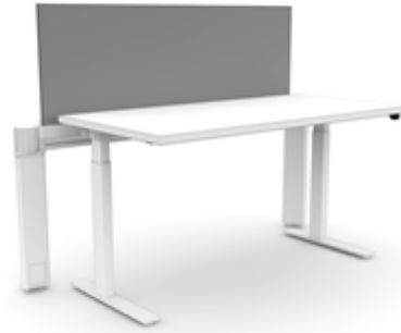
Further Screen (13"H) Glass or Fabric Options Glass: 24W – 96"W Fabric: 24"W – 60"W List Price: $519 - $686 (Grade A Fabric) List Price: $625 - $1,359 (Glass)