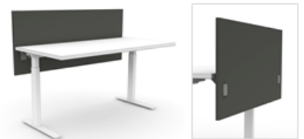
Involve End Privacy Panel (25\"/>