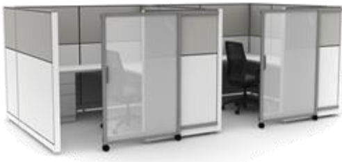
42.5”H panels w/ 22.5”H Stacking Frames Additional panels and panel system door **note that panel system door designed for 36” opening 50”H, 65”H, 80”H 42”W