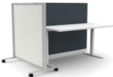
Aware Mobile Marker or Tack Board (48"W x 50"H) Porcelain, laminated glass or fabric options 36"W – 60"W 50"H, 72"H