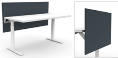
Stride Screen (28\"/>